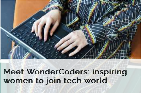
Meet WonderCoders: inspiring women to join tech world